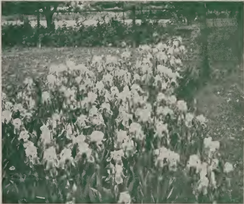
Border of Iris

This is our selection of the best of each color pattern. Many of them may be purchased at a considerable saving in a collection.